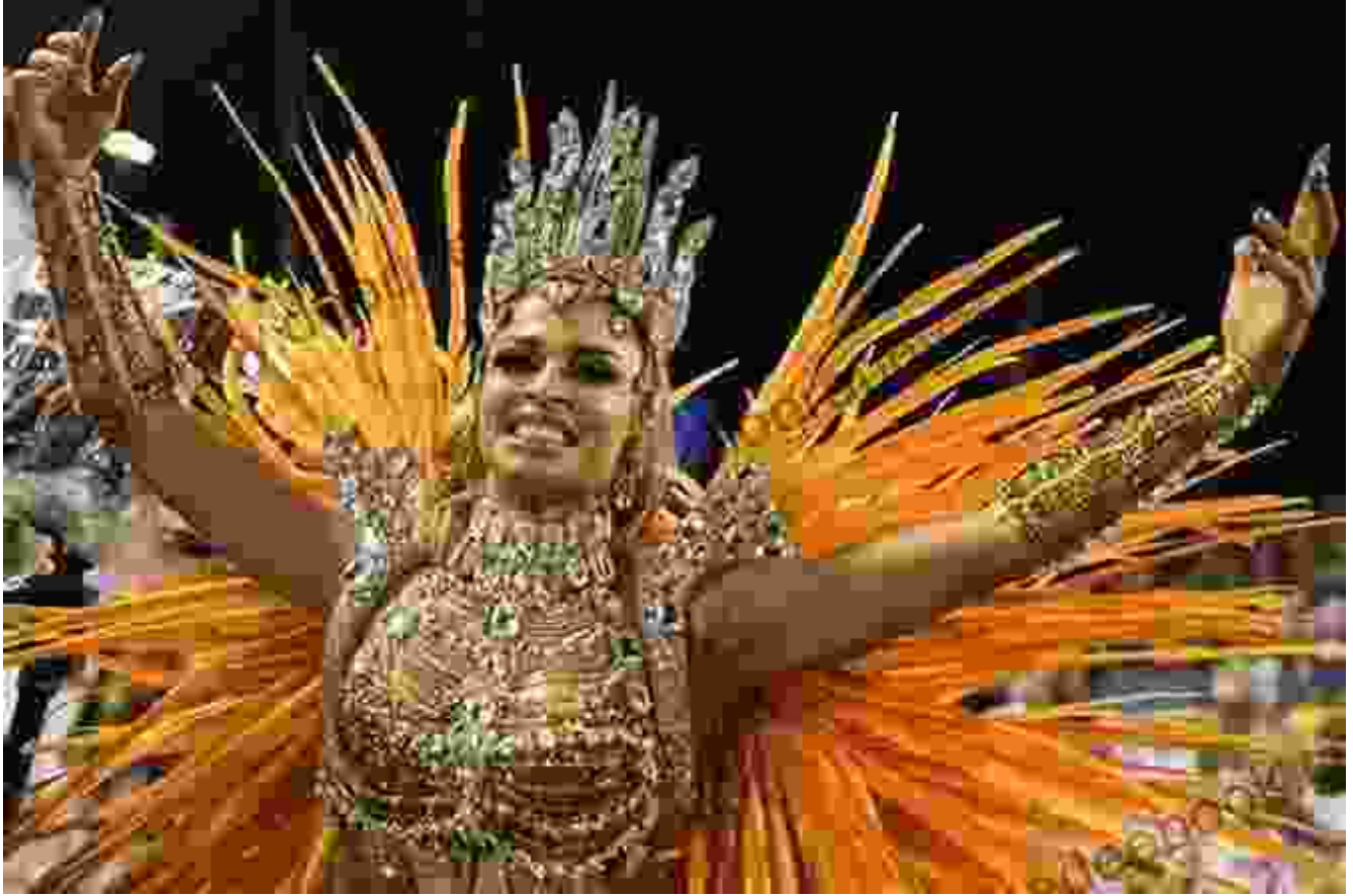
Capoeira: Witness the Dance of Warriors