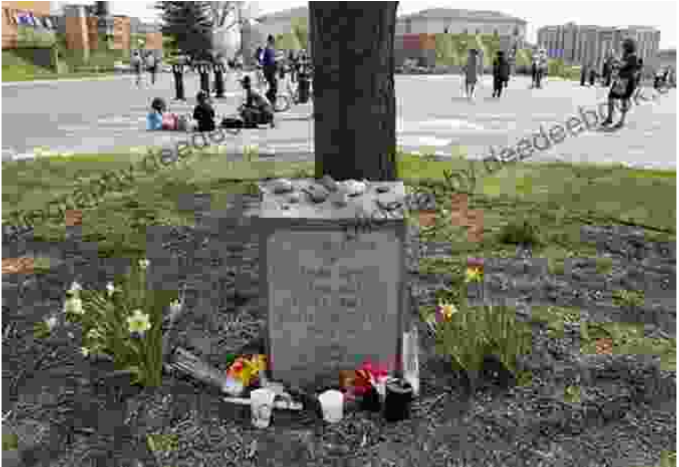
Memorial to the victims of the Kent State shootings