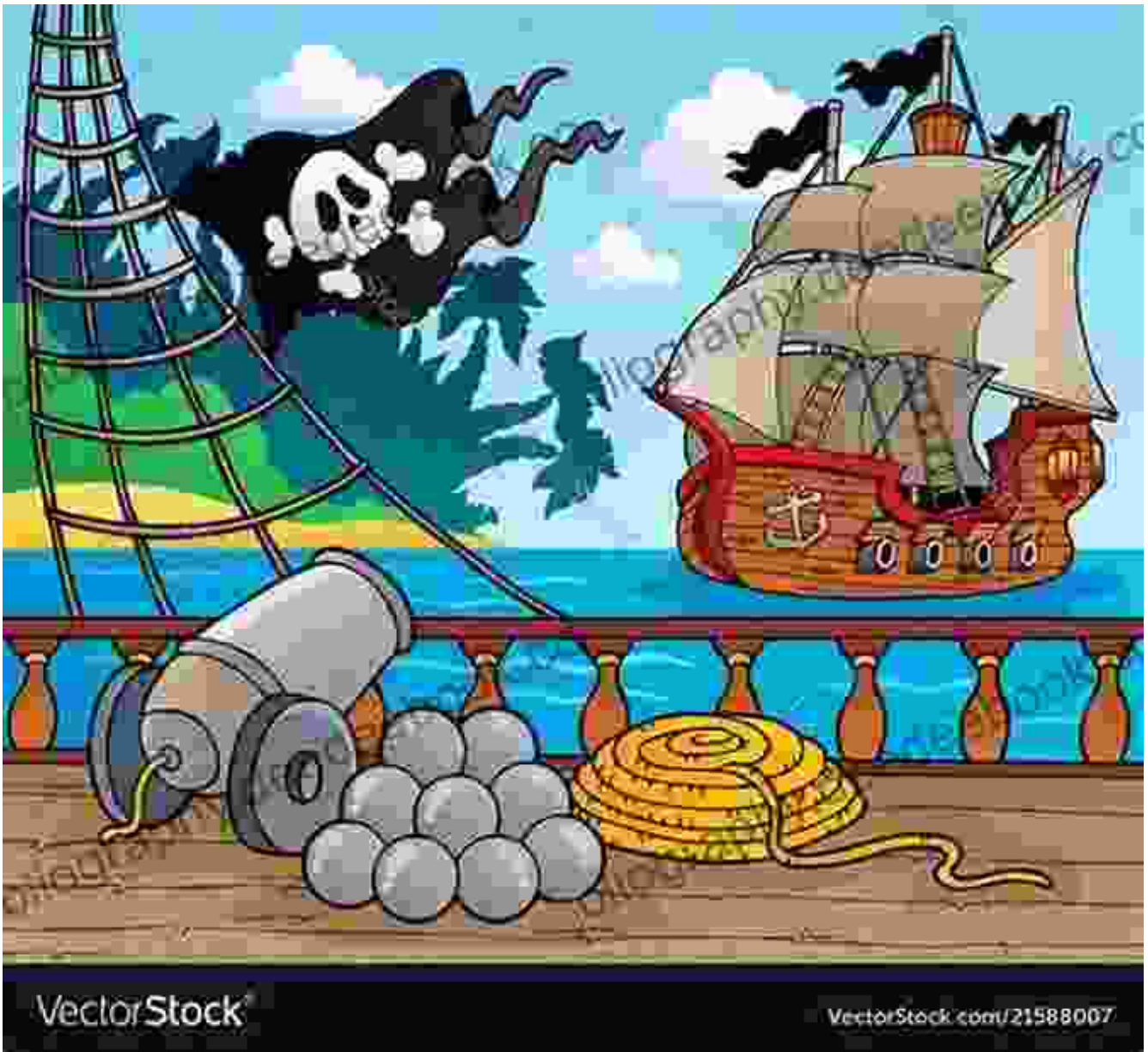
Illustration by Polly Dunbar from 'Are You The Pirate Captain?'